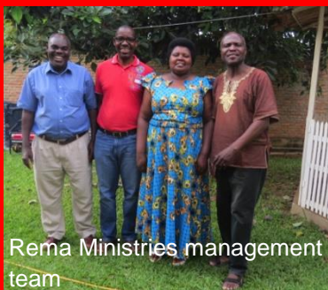
Rema Ministries management team